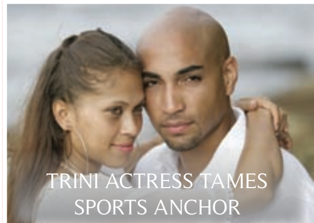
TRINI ACTRESS TAMES SPORTS ANCHOR

PARTIES . FASHION . SCOOPS . BEAUTIES . SPORT