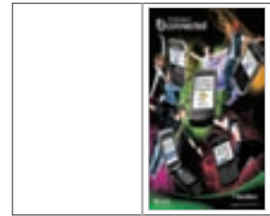
Full Page 9" W x 11" H