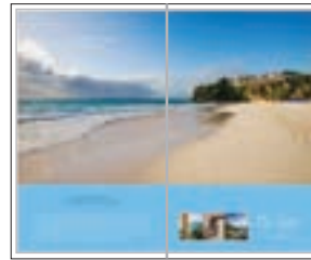
Double Page Spread 18" W x 11" H