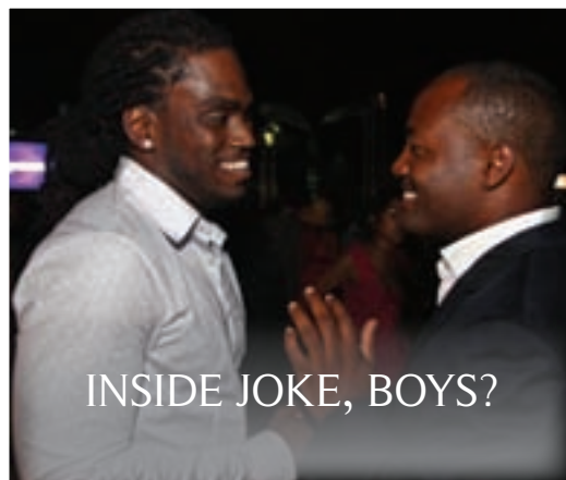
INSIDE JOKE, BOYS?