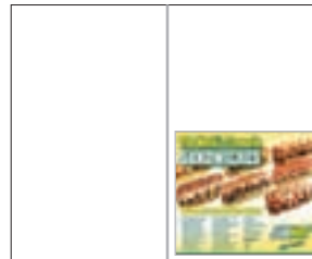
Half Page 9" W x 5.5" H